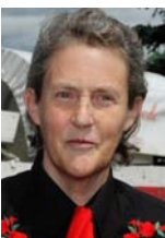
Temple Grandin - The professor of animal science at Colorado State University is one of the most accomplished and well-known adult with autism in the world.