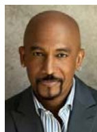
Montel Williams --American celebrity and former television talk show host.