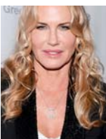
Daryl Hannah - The actress talked to People Magazine about being diagnosed with autism as a child, and how it contributed to a fear of fame as an adult.