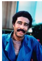
Richard Pryor was an American comedian, actor, and writer. He is also regarded as the most important stand-up comedian of his time.