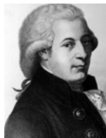
Amadeus Mozart - Famous musician.