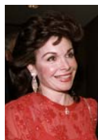
Annette Funicello --She was Walt Disney's most popular Mouseketeer.